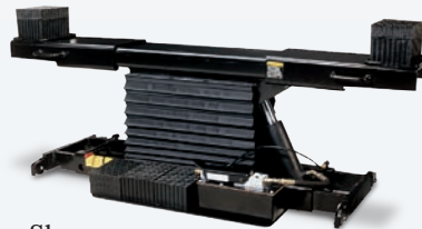
Shown: 9,000 lbs. capacity rolling jack PART # RJ901000BK