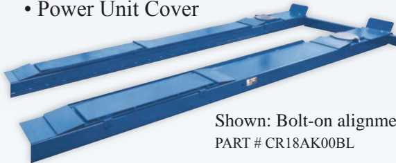
Shown: Bolt-on alignment kit PART # CR18AK00BL