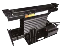
7,000 lbs. Rolling Bridge Jacks